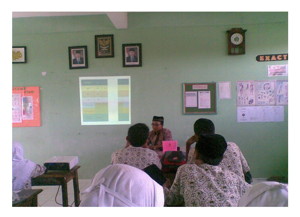
Teacher of Fiqh teach in class X in MA Mazro'atul Ulum Paciran Lamongan