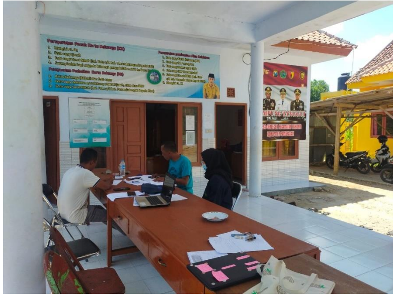
Picture when interview in Cenlecan Village Office