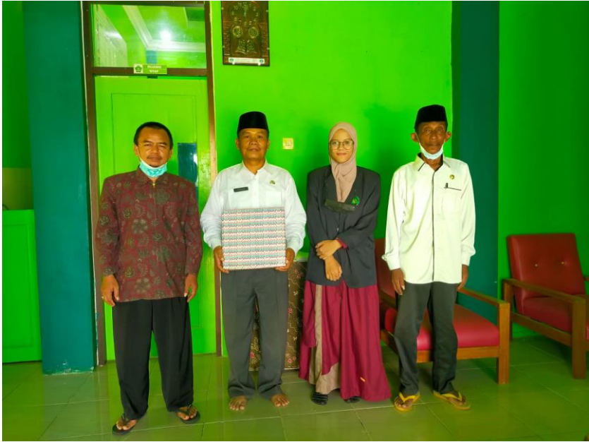
Picture when interview in KUA Pakong