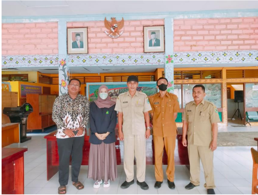
Picture when interview in Pakong District Office